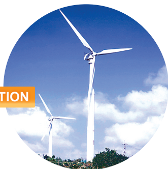
Wind power generator plant (Okinawa, 1998)