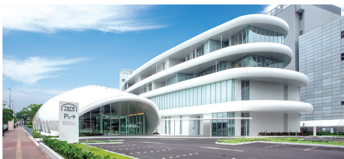
Net Zero Energy Building - ZEB TOTO MUSEUM (FUKUOKA)