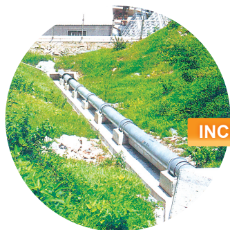
Small-scale hydraulic power generator plant (Kochi, 1991)